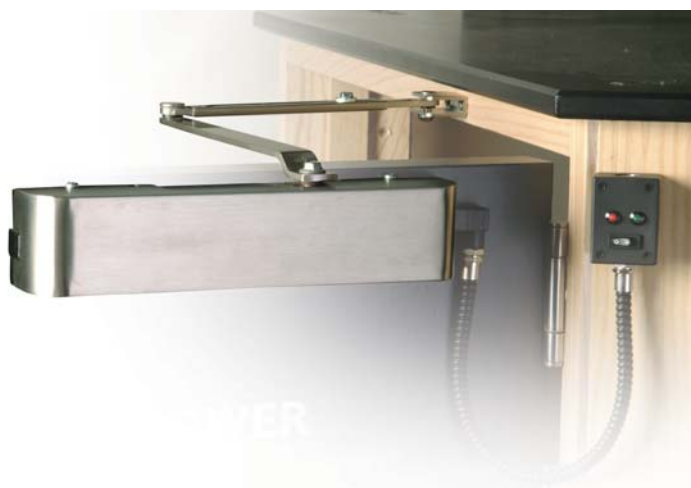
9070 Dual Power

An excellent series of multi-application, architectural overhead door closers available in two stylish designs and complete range of finishes